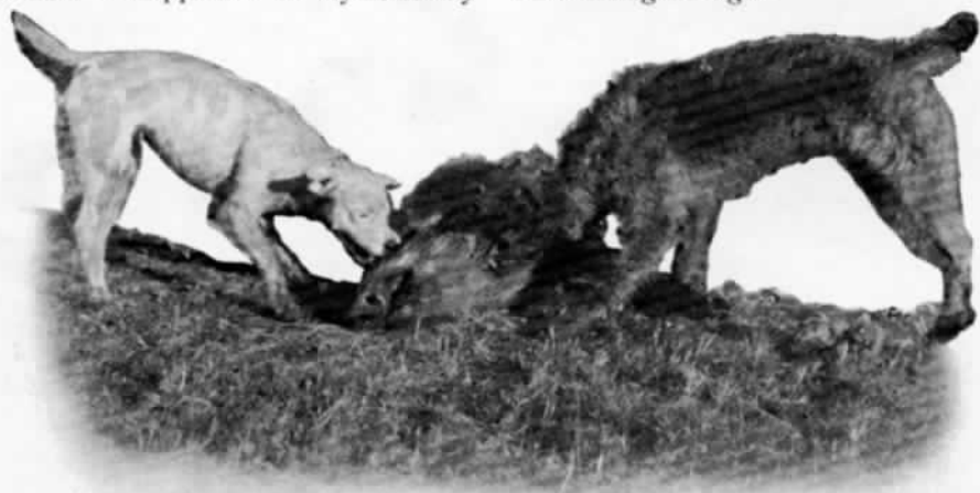
VENTING THEIR SPITE ON THE FALLEN FOX.

At extreme low tide we sometimes gathered abalones and mussels. These shellfish clamped themselves to the rocks just at the limit of low water. We had to dash madly down the slippery ledges between waves. The rocks were black and pitted and hairy with the long green sea-grasses, and monstrous with strange mushy organisms that spouted water at our touch. Armored crabs rattled into hiding. We slipped into little pools. The water drained away before us with a trickling and sucking. At the lowermost point we tore away an armful of the mussels, or pried loose an abalone with a quick twist of a bar. Then we fled madly, the roar of the sea behind us, the booming of the surf in our ears, the swift upward hissing rush of the wash at our heels. Around us blew the spray. And occasionally one of us got caught, to the other's huge delight.